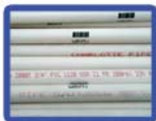
PVC Pipe SDR 21 Class 200 Pipe Size = 3/4" Minimum Wall = .060" + .020" Outside Dia. = 1.050" ± .004" PSI @ 73.4 F = 200