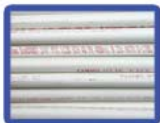
PVC Pipe Schedule 40 Pipe Size = 3/4" Minimum Wall = .113" + .020" Outside Dia. = 1.050" ± .004" PSI @ 73.4 F = 480